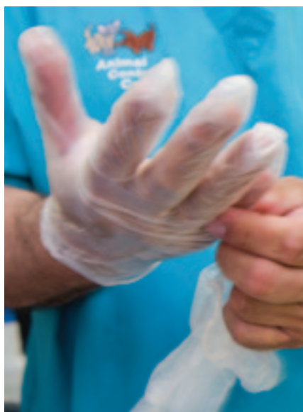
Once you've removed clumps from a litterbox, it's critical to change your gloves before moving on to the next cage.

It's helpful to think of each cat cage as that cat's safe little "pod," and everything outside of it as "the danger zone." Every space in the shelter that gets contacted by multiple cats must continue to get the full disinfection treatment every day. That goes