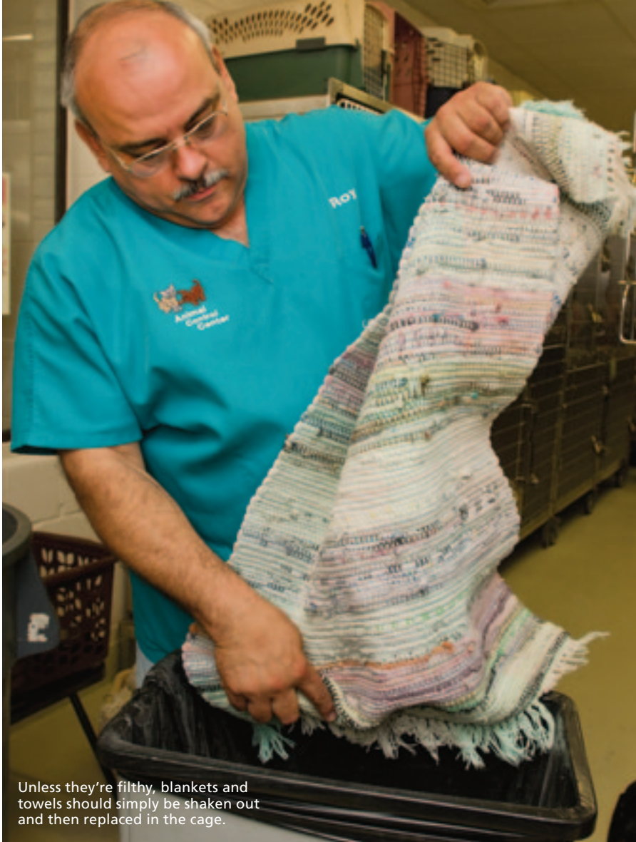
Unless they're filthy, blankets and towels should simply be shaken out and then replaced in the cage.

The idea, she says, is to lessen the viral load. "If you just start from one side of the room and go around, then you're just adding fomites, adding all of the disease onto whatever you come in contact with, and by the time you get to that kitten, the viral load, the dose that they're getting, is going to be a little bit from everybody in that room."